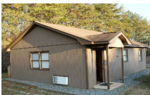
Family Cabins for Women