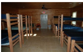
Belk Lodge-For Men