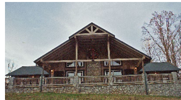
Smith Training Lodge