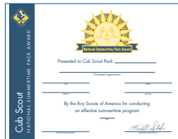
One Pack Award Certificate, No. 33731

Please send us the following National Summertime Pack Award items: