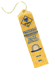
_____ Den participation ribbons, No. 616254