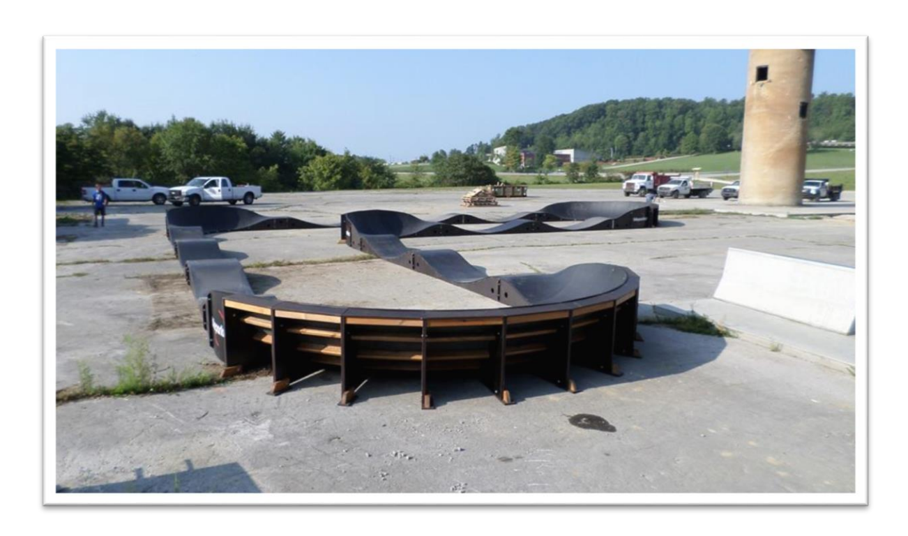
(Above) example of a pre-fabricated track