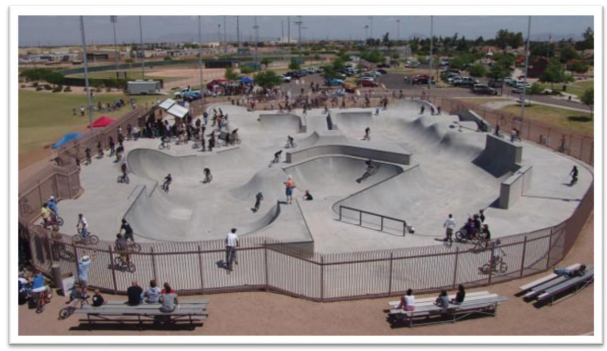
Scouts that are interested and capable of riding in this environment should pursue their sport at a professional skate park.