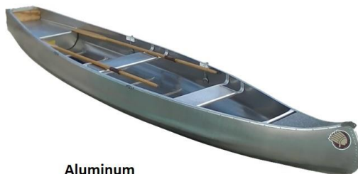
Aluminum Length: 17' Beam: 44" Weight: 113 lbs. Capacity: 1000 lbs.