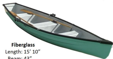
Fiberglass Length: 15' 10" Beam: 43" Weight: 87 lbs. Capacity: 775 lbs.

The chosen craft are marketed as square stern canoes but are actually designed for use with small outboards. They are more streamlined than traditional camp rowboats but are very similar in design to high-end rowing wherries. They both handle well and have sufficient beam to accommodate single and tandem rowing positions without outriggers. The fiberglass boat retails for ~ $800. The aluminum boat retails for ~ $1500. Additional details will be provided in a forthcoming communication.