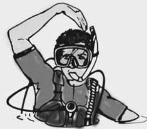
OK? OK! (one hand occupied)