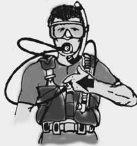
Me or watch me.