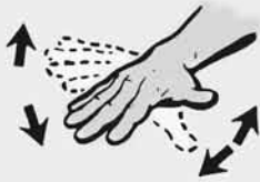
Something is wrong.