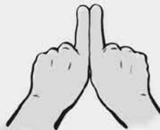
Get with your buddy.