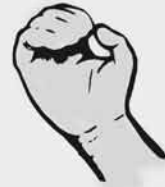
OK? OK! (glove on)