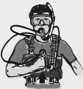
Low on air!