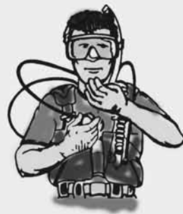
Buddy breathe or share air