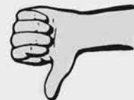
Go down; going down