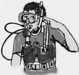
Ears not clearing.