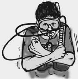
I am cold.