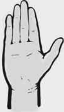
Stop; hold it; stay there.

These are standard scuba hand signals that are useful both above and below the surface. You will learn these as part of your Scuba BSA experience. Hand signals used with express permission of International PADI, Inc. © International PADI, Inc.