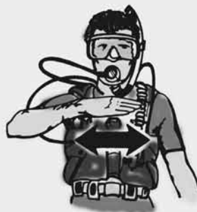
Out of air!