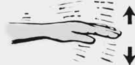
Take it easy; slow down.