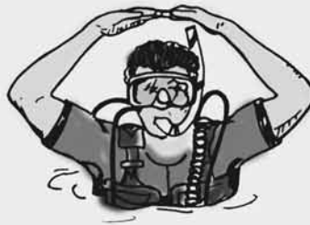
OK? OK! (on surface at distance)