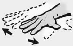
Level off; this depth