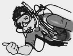
Go that way.