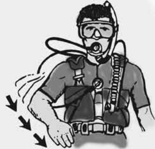
Under, over, or around