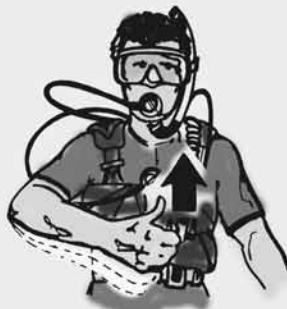
Go up; going up