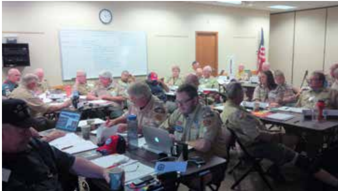
Commissioners at work during the Administrative Commissioner conference