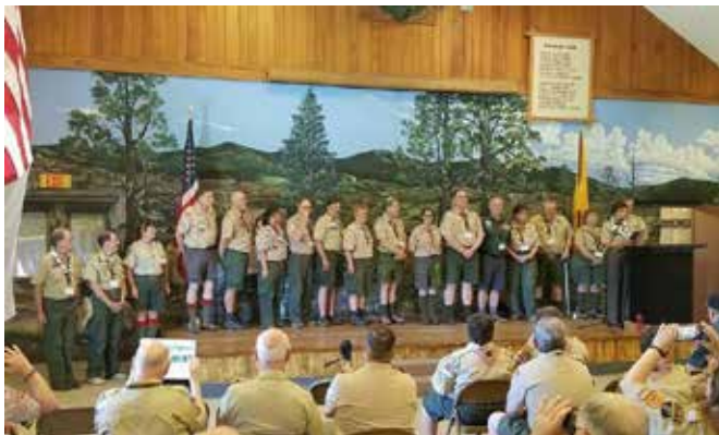
Commissioning ceremony at Philmont Training Center