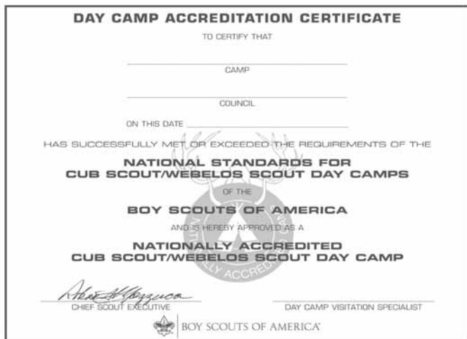
Day Camp Accreditation Certificate, No. 430-110