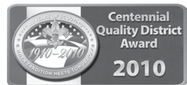
Centennial Quality District Emblem