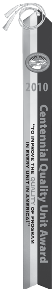
Centennial Quality Unit Streamer