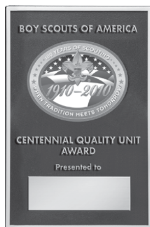
Centennial Quality Unit Plaque