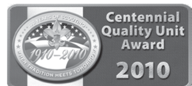
Centennial Quality Unit Emblem