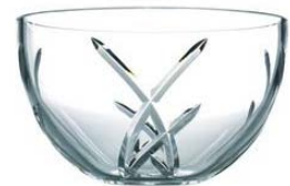
Second Century Society etched Waterford John Rocha Signature Bowl