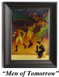
"Men of Tomorrow"