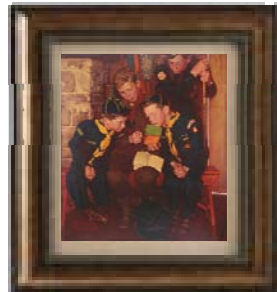
"The Right Way"