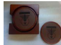
Second Century Society Coaster Set