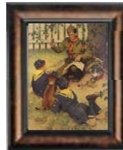
"The Adventure Trail"